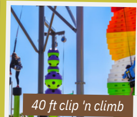
40 ft clip 'n climb