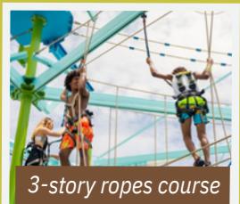
3-story ropes course